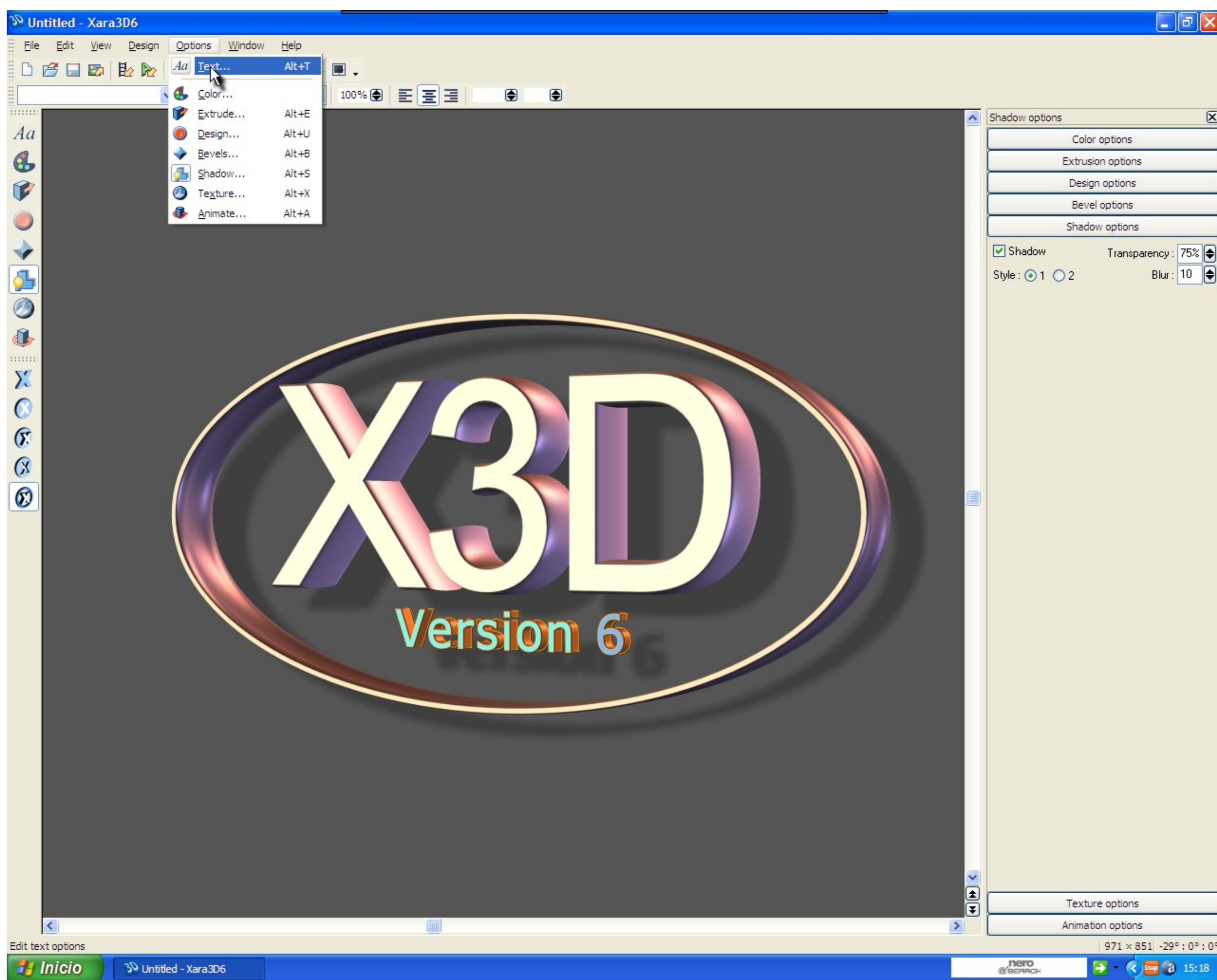
Xara 3d 6 Crack 73